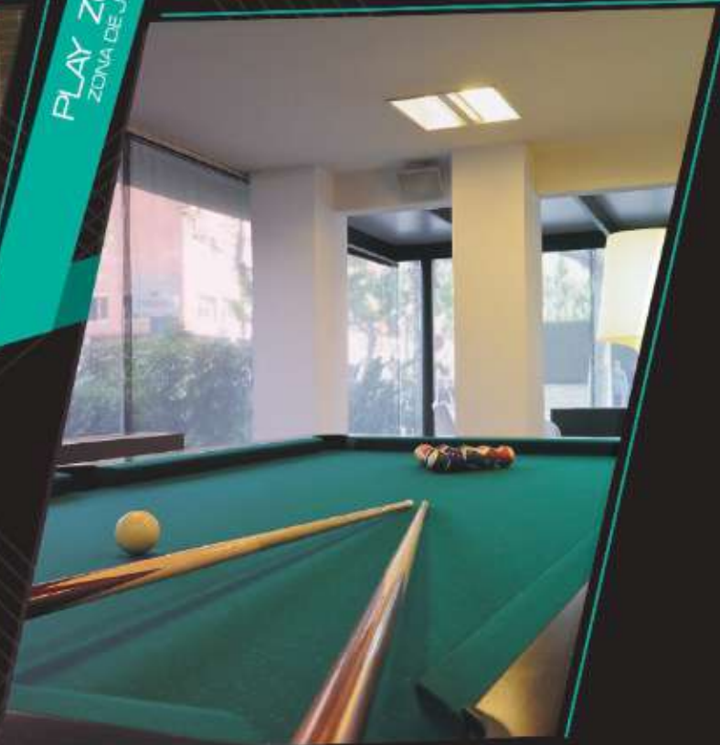
AREA ESPECIALLY CREATED FOR LARGER EQUIPPED WITH POOL TABLE .