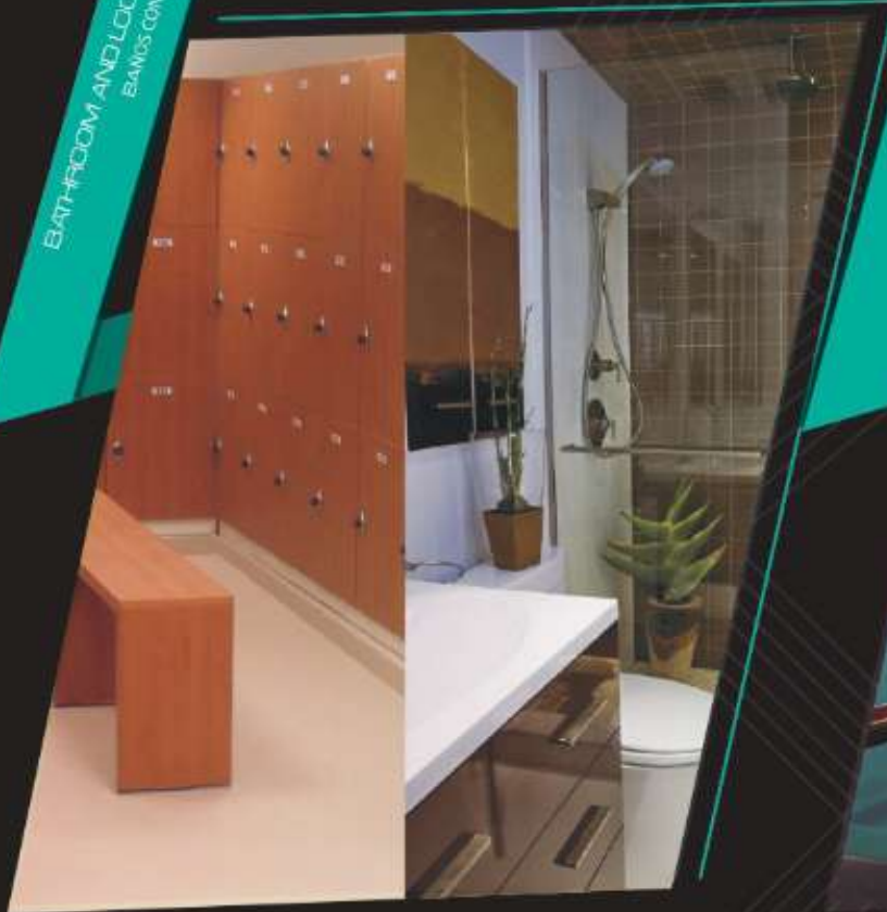
BATHROOM MEN- WOMEN